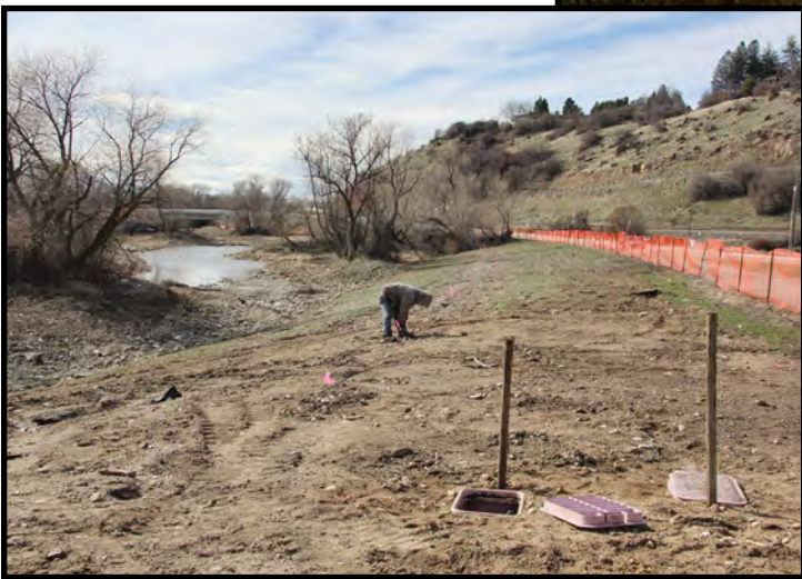
Walling Creek under construction in 2012.